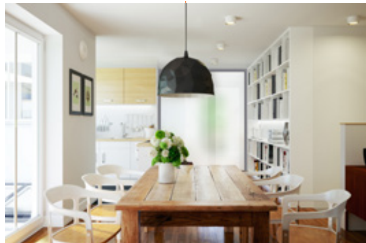
OFF Installed in a wall opening, it will give an effect of an extraordinary internal window, the transparency of which can be changed by means of a remote control.