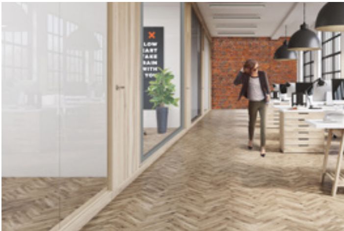
ON Unique partition wall

SEE WHAT OPPORTUNITIES ARE OFFERED BY THE 'PLUG AND PLAY' SYSTEM