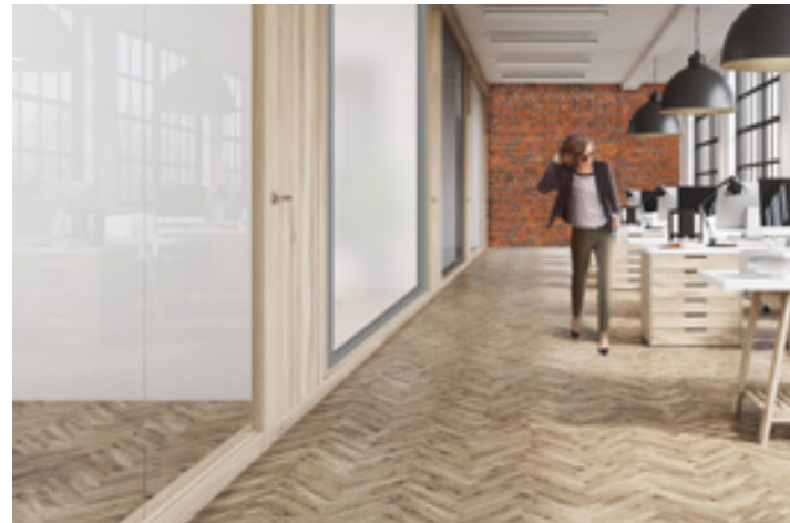
OFF A unique partition wall, which will guarantee access of the natural light, or privacy in its opaque state.